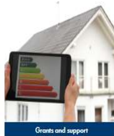
Grants and support