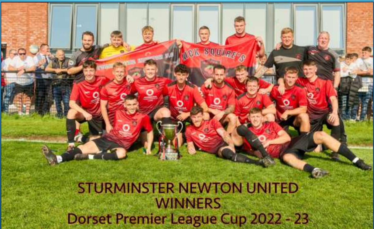
STURMINSTER NEWTON UNITED WINNERS Dorset Premier League Cup 2022 - 23