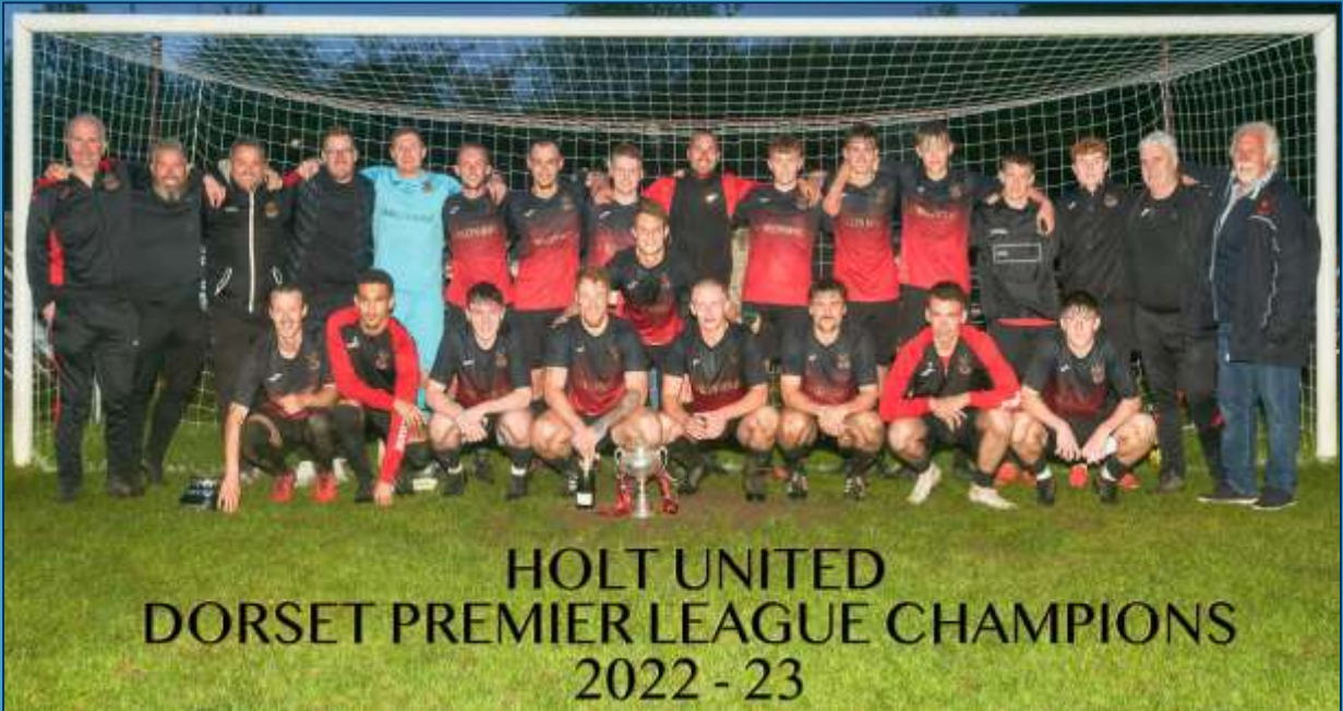
HOLT UNITED DORSET PREMIER LEAGUE CHAMPIONS 2022 - 23