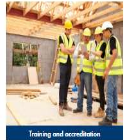
Training and accreditation