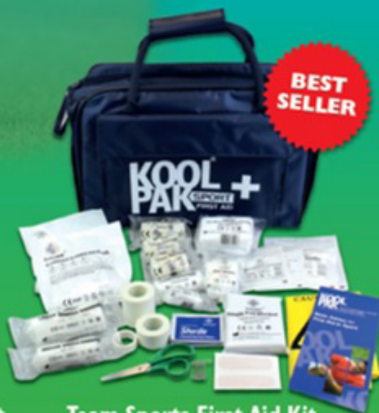
Team Sports First Aid Kit - £20.45