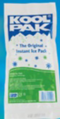
Koolpak Original Ice Pack - As low as 59p per pack