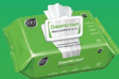
Multi Surface Disinfectant Wipes - £7.33