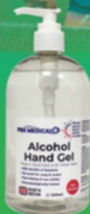
Alcohol Hand Gel - £4.24